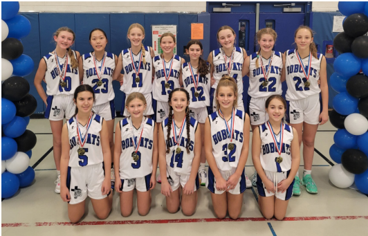
Tony LaValle Tournament Champions