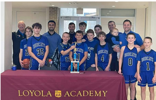
Loyola Tournament Consolations Champions