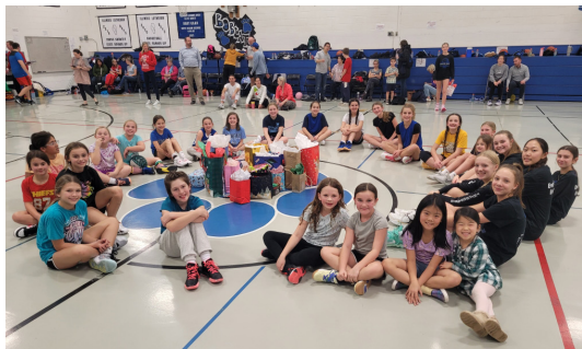
Girls Basketball Christmas Party