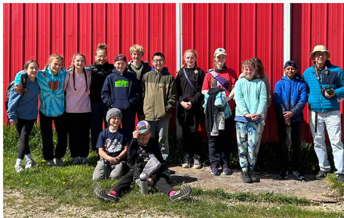
Grade 6 Walcamp Trip

Monthly Newsletter of Immanuel Lutheran School