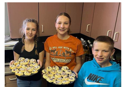
West Virginia Mission Trip