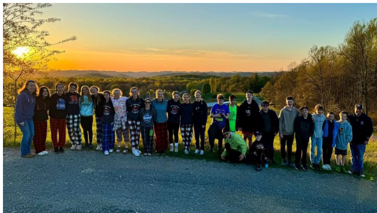
Grade 7 & 8 West Virginia Mission Trip