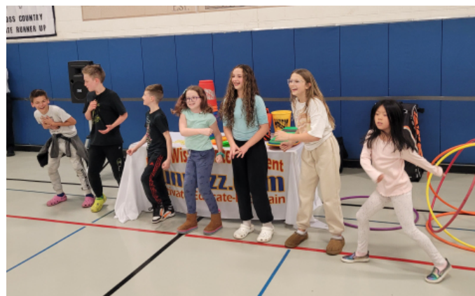
Fun Whizz Assembly, April 18